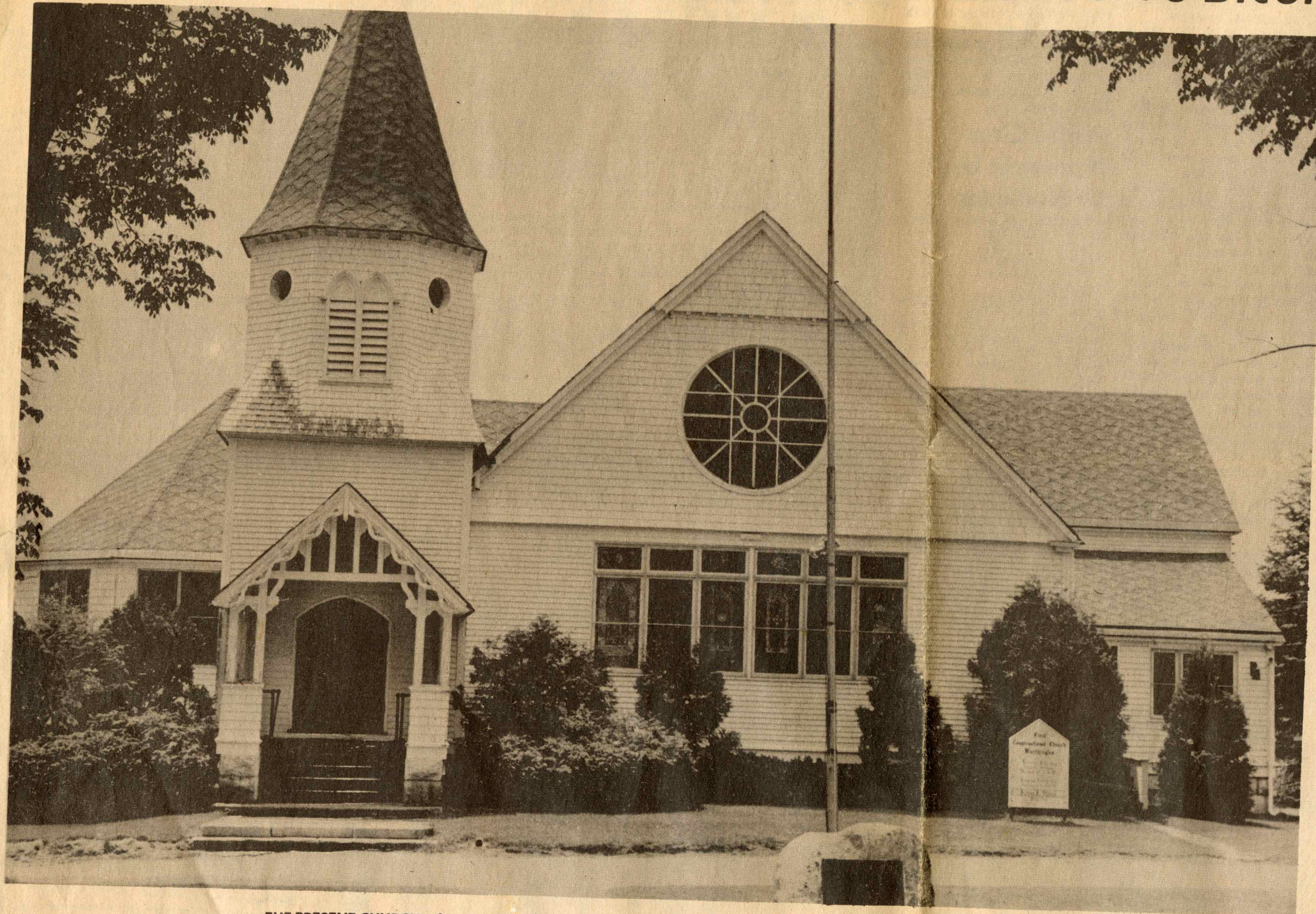
THE PRESENT CHURCH, of unusual design for New England Congregational structures, faces Huntington Road.